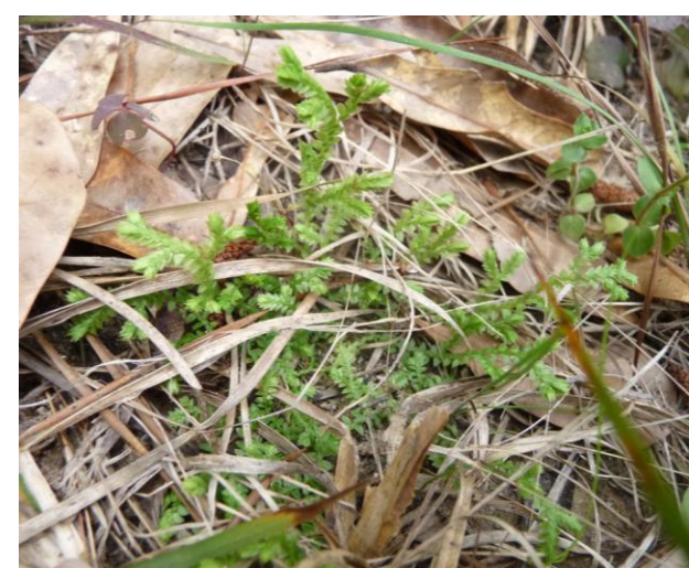
Selaginella apoda Meadow Spike Moss