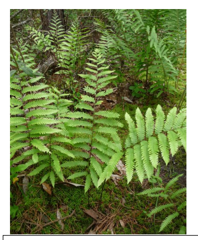
Woodwardia virginica Virginia Chain Fern