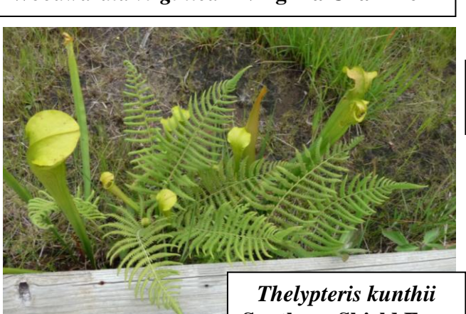
Southern Shield Fern