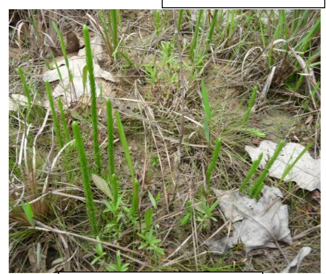
Lycopodium appressa Appressed Bog Club Moss