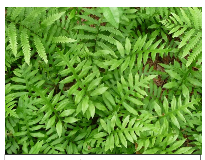
Woodwardia areolata Narrow-leaf Chain Fern