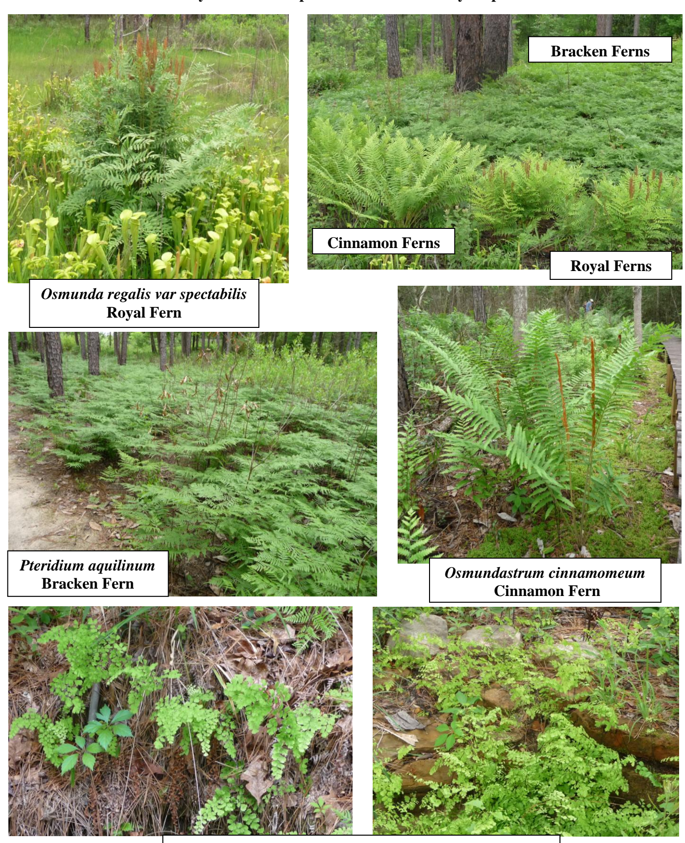
Adiantum capillus-veneris Southern Maidenhair Fern